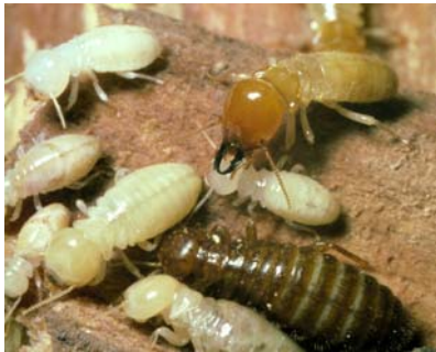
Photo: 19 - Mastotermes : A soldier and neotenic plus some workers