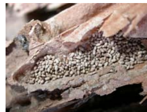
Photo: 28 - Drywood termite pellets, Incisitermes, family Kalotermitidae