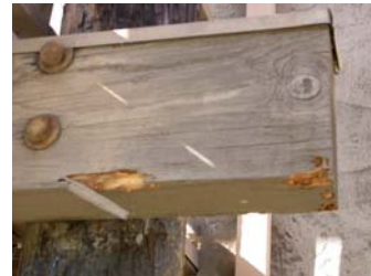
Photo: 26 - Drywood termite damage, Incisitermes, family Kalotermitidae