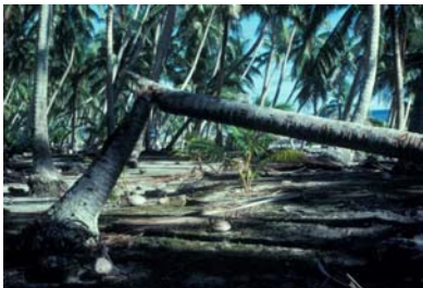
Photo: 11 - Coconut palm attacked by Neoterms rainbowi