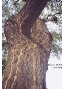
Photo: 1 - Reticulitermes sp. attacking an urban tree in the city of Paris