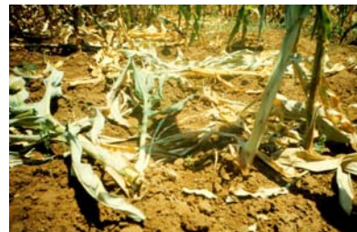
Photo: 6 - Damage to crops caused by subterranean termites