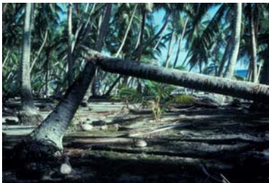
Photo: 11 - Coconut palm attacked by Neotermes rainbowi