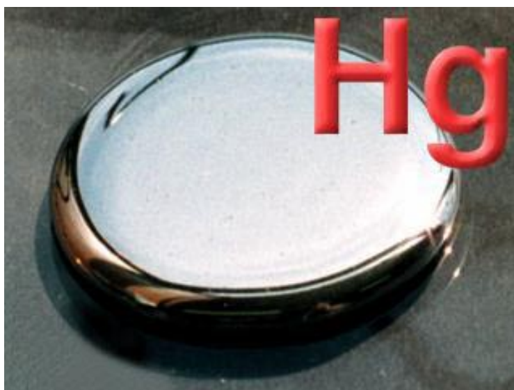
A drop of mercury