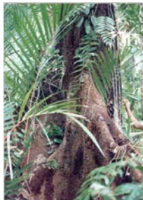
Photo: 3 - Soil and carton layer on the trunk of a buttressed forest tree in Southeast Asia, typical symptoms of attack by Coptotermes curvignathus