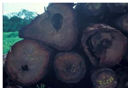
Photo: 14 - Native rain forest trees "piped" by Neotermites