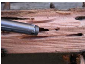
Photo: 27 - Drywood termite damage, Incisitermes, family Kalotermitidae