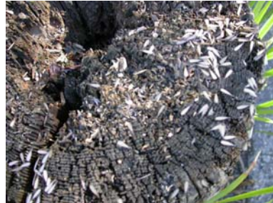
Photo: 24 - Subterranean termite swamers, Reticulitermes, family Rhinotermitidae