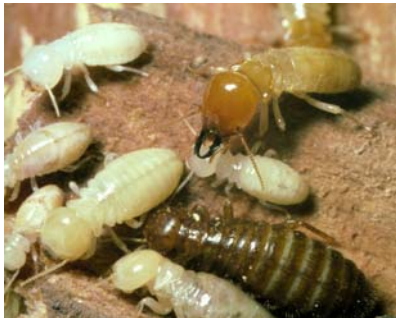
Photo: 19 - Mastotermes : A soldier and neotenic plus some workers