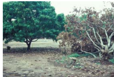
Photo: 12 - A tree (right side) killed by Mastotermites and fallen over