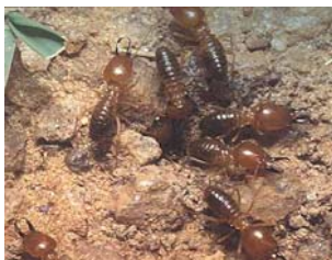
Photo: 5 - Syntermes nanus , a harvester mandibulate nasute which is an important pest of sugar-cane, Eucalyptus and other crops in South America