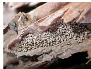
Photo: 28 - Drywood termite pellets, Incisitermes, family Kalotermitidae