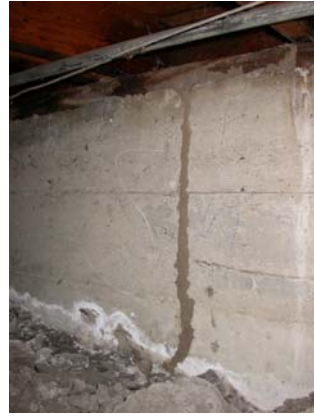
Photo: 22 - Subterranean termite foraging tube, Reticulitermes, family Rhinotermitidae