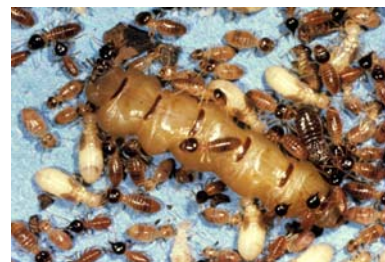
Photo: 20 - Queen, King and Workers