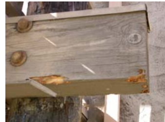
Photo: 26 - Drywood termite damage, Incisitermes, family Kalotermitidae