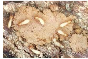
Photo: 2 - Soldiers of Coptotermes curvignathus , a termite species that kills trees in Southeast Asia