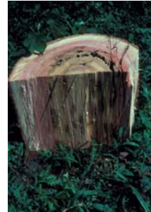
Photo: 10 - Mahogany neotermites cross section