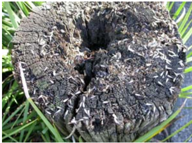
Photo: 23 - Subterranean termite swamers, Reticulitermes, family Rhinotermitidae