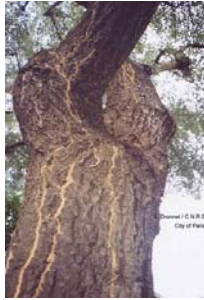
Photo: 1 - Reticulitermes sp. attacking an urban tree in the city of Paris