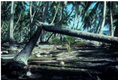
Photo: 11 - Coconut palm attacked by Neotermites rainbowi