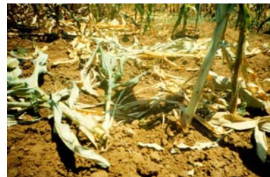
Photo: 6 - Damage to crops caused by subterranean termites