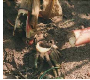
Photo: 8 - Credible information is difficult to obtain with regard to termite damage to crops.