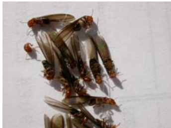
Photo: 25 - Drywood termite swamers, Incisitermes, family Kalotermitidae