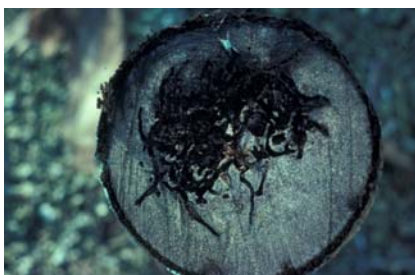
Photo: 13 - Cross section of a coconut palm attacked by Neotermites rainbowi